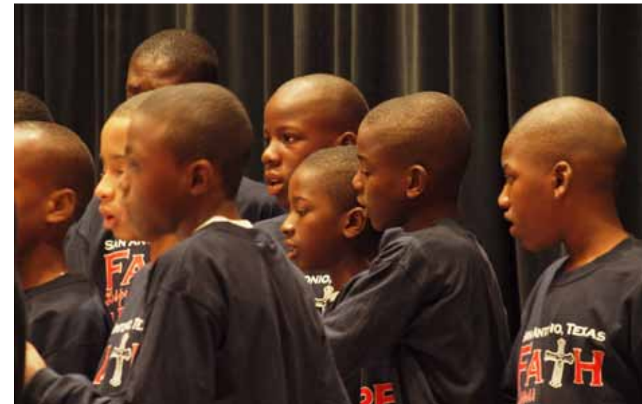
Les Petits Chanteurs

Episcopal Schools Night Fund Raiser for Haiti San Antonio Spurs, San Antonio, TX