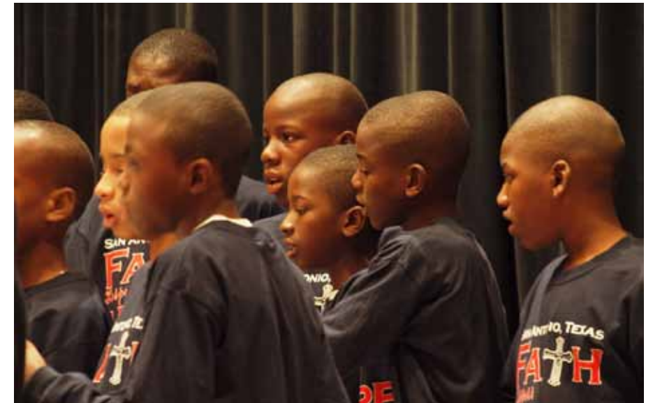
Les Petits Chanteurs

Episcopal Schools Night Fund Raiser for Haiti San Antonio Spurs, San Antonio, TX